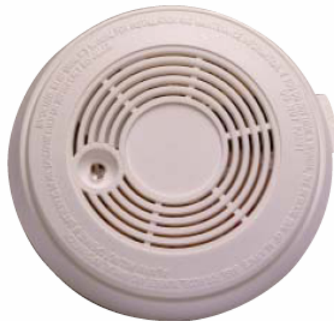
83RECN is battery operated with a test button